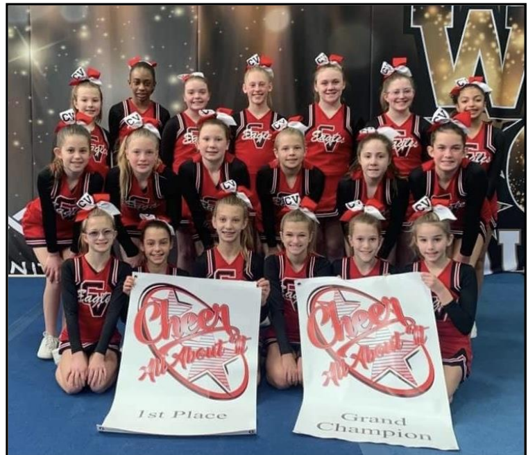
2021 CVYCA Ponies

Distribution of this material does not constitute endorsement by Cumberland Valley School District.